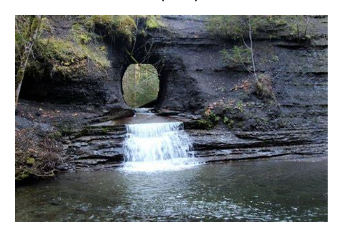
Roger Creek Nature Trail – Log Train Trail