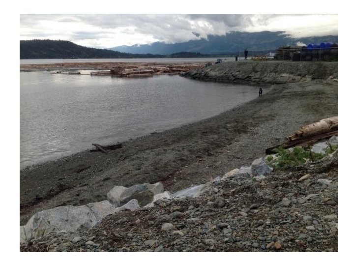
Waterfront Park - Canal Beach