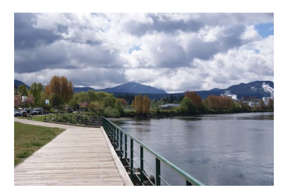
Harbour Quay – Centennial Pier – Tyee Landing