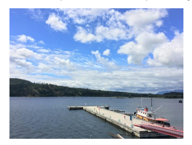
Waterfront Park - Canal Beach