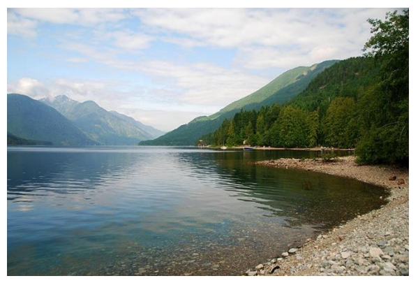
For more info, check out our Visitor's Centre at the junction of North & South Port Alberni.