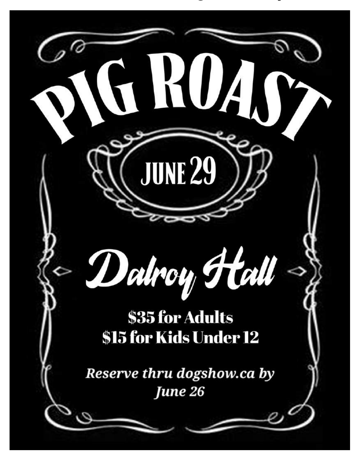
Dalroy Hall is Five Minutes from the field.

Foothills Gazehound Club is pleased to be joining the Dalroy UFA Association in Celebrating Canada Day 2024