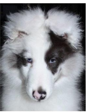
Have those beautiful eyes checked!