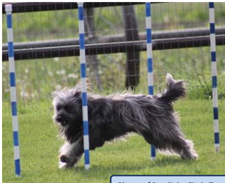
Photo of Bandit

*Outdoors on grass at Kelowna Dog Sport Centre, rain or shine