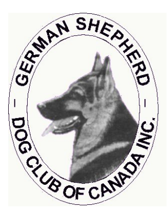
Official Premium List