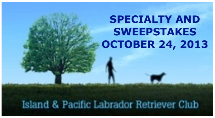
CKC Event 133330