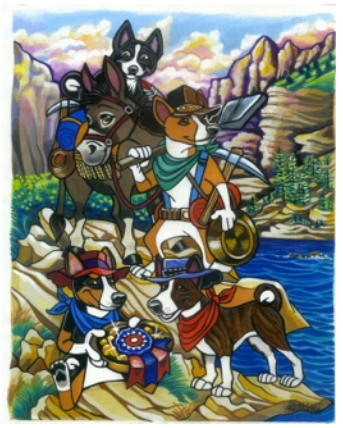
PANNING FOR POINTS!!