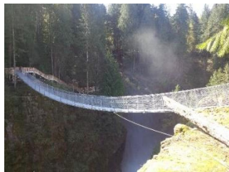
Elk Falls Provincial Park Suspension Bridge