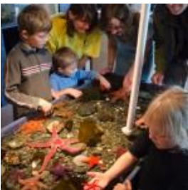
Discovery Passage aquarium