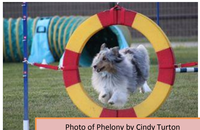
Photo of Phelony

A dog that has entered a trial and subsequently earns a title shall be permitted to move up. Please notify the Trial Secretary as soon as possible. Same-day move-ups will be allowed. Class Move-up Forms will be available. Please complete one immediately after confirmation of your completion of a title.