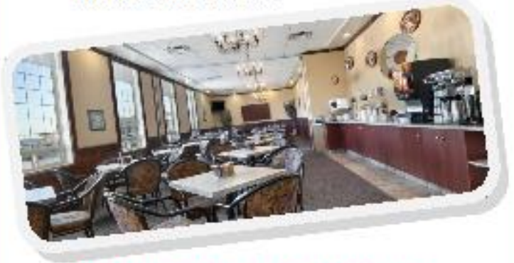
You do your thing, Leave the rest to us.*