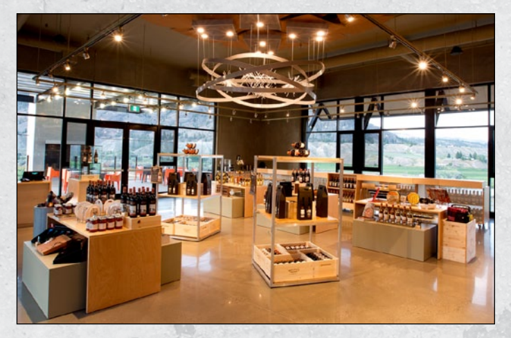
Tasting Room open daily 10 am - 6 pm

Both the Tasting Room and the Terrace offer spectacular views across the South Thompson River to the Lion's Head on the north side of the valley (worth the stop all on its own!).