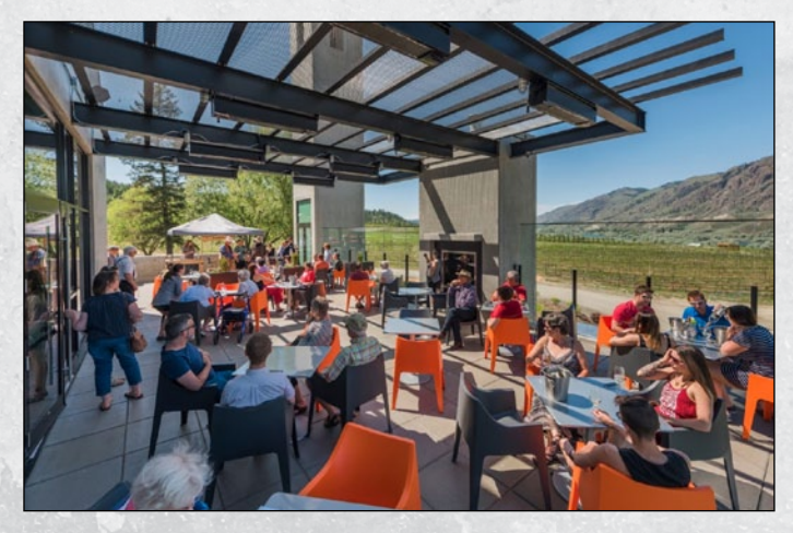
Terrace open daily 11:30 am - 6 pm (unless it is raining)